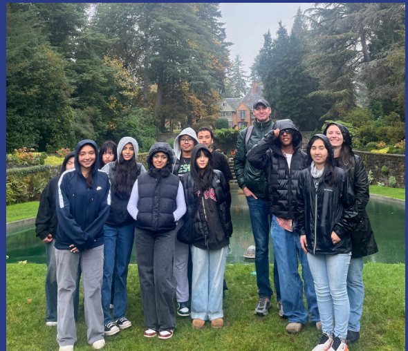
Minds Matter Students At Lewis & Clark College