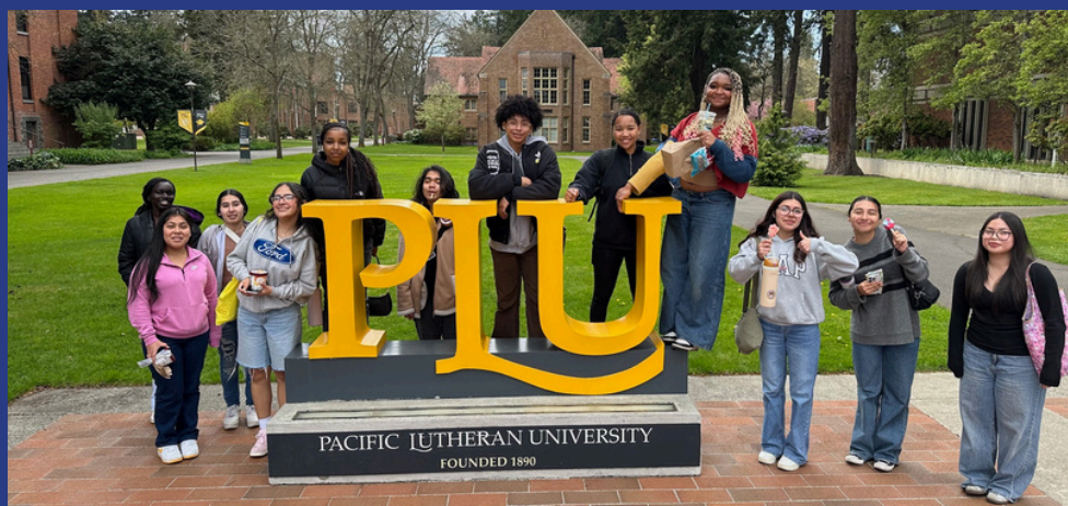
Minds Matter Students At Pacific Lutheran University