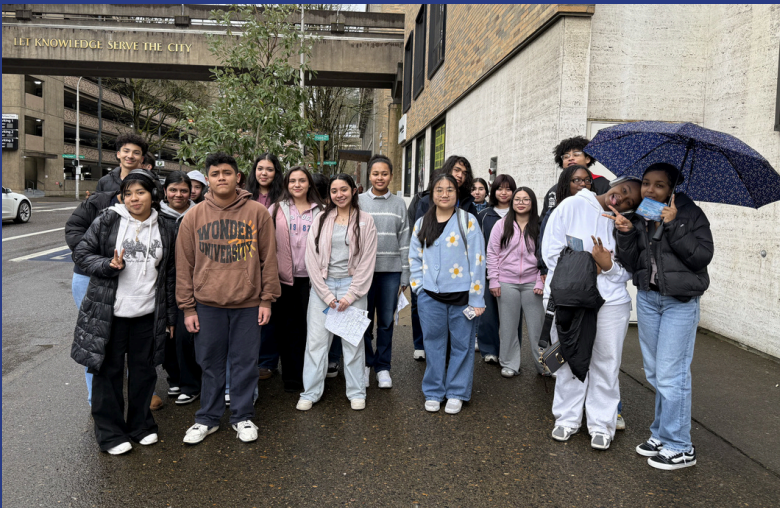
Minds Matter Students At Portland State University

Juniors and seniors also traveled to Pacific Lutheran University for a full day of exploration. They toured the campus, watched volleyball and softball games, and met with an admissions officer. Since 2010, 41 Minds Matter graduates have gone on to attend PLU. During the visit, students enjoyed lunch in the dining hall with four current Minds Matter alums, getting firsthand insight into campus life and the college experience.