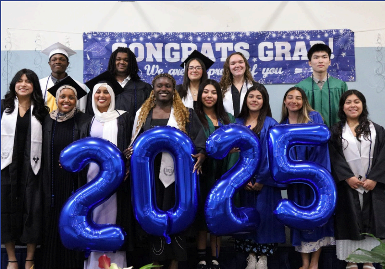
Minds Matter Class of '25 at Minds Matter Portland Graduation Ceremony

We are thrilled to celebrate the outstanding achievements of the Class of 2025! This year's graduates are taking bold steps into the future, heading to an incredible range of universities across the country, including the University of Chicago, University of Portland, St. Olaf College, Oregon State University, Whitman College, Seattle University, Harvey Mudd College, University of Oregon, Pacific Lutheran University, Carleton College, Santa Clara University, Boston College, and Villanova University. Their journeys are just beginning, and we couldn't be more proud. Here's to new adventures, lifelong learning, and the bright futures that await!